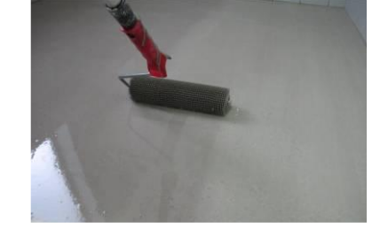
Levelling of the surface with a spike roller