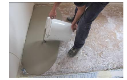
Application of PLAN LEVEL 315