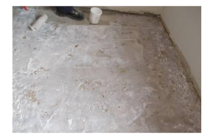
Application of \it MICROART\,AD\,21 primer

Once mixed, pour the material onto the floor, using a trowel or spatula to level the surface. If necessary, use a spiked roller to remove any air bubbles.