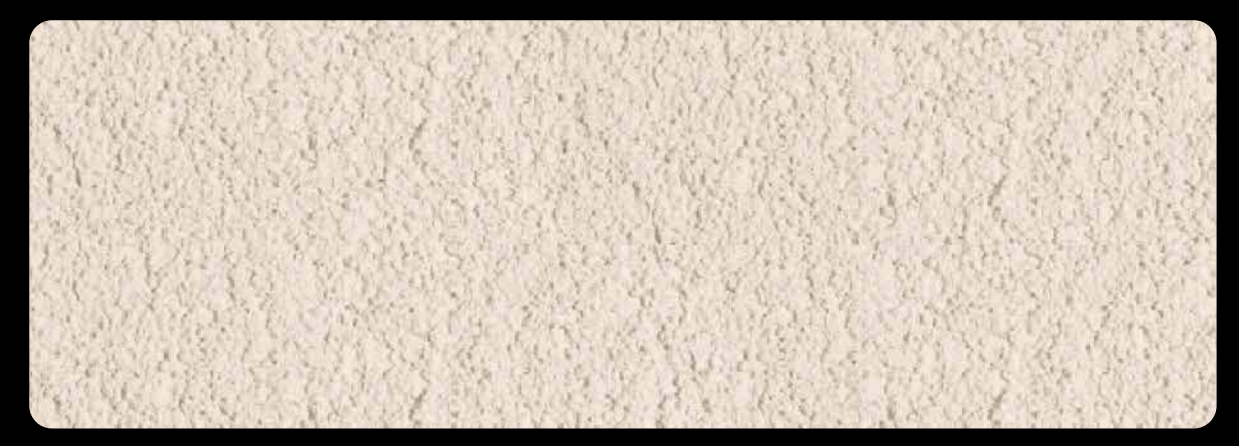
REABILITA CAL AC