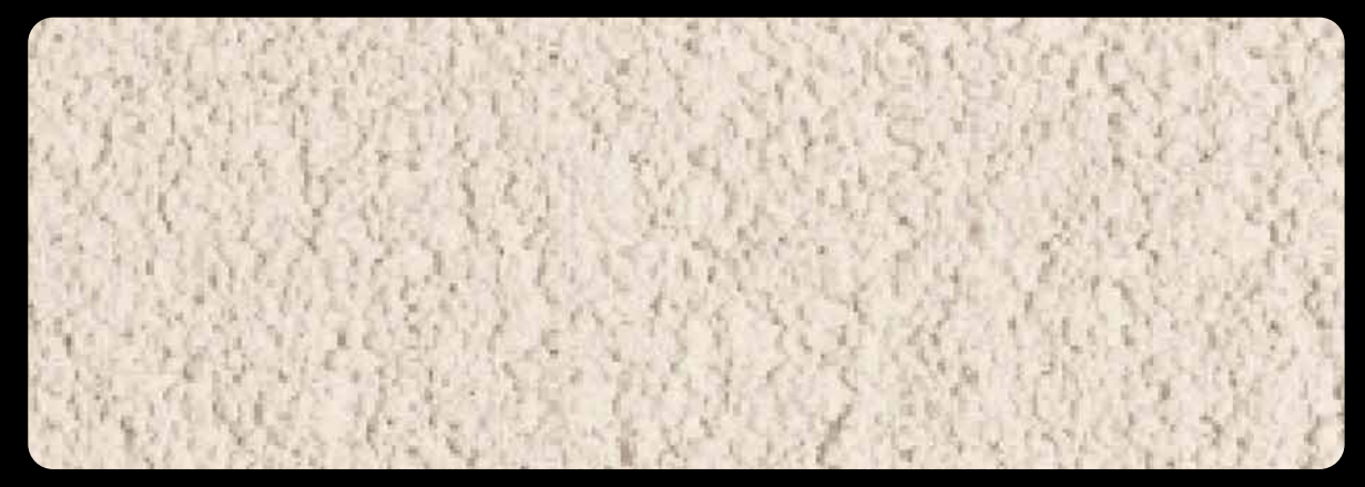
REABILITA CAL AC SANDED

REABILITA CAL AC allows for fine-sanded finishes. Using a smoothing technique, you can achieve even textures. In turn, REABILITA CAL AC FINO is conceived to promotes a smooth texture.